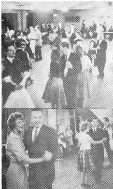
Chicago-LaGrange Social held December 16 at Wozniak's Hall.

IF YOU WANT TO STAY YOUNG, "TRY DANCING"!